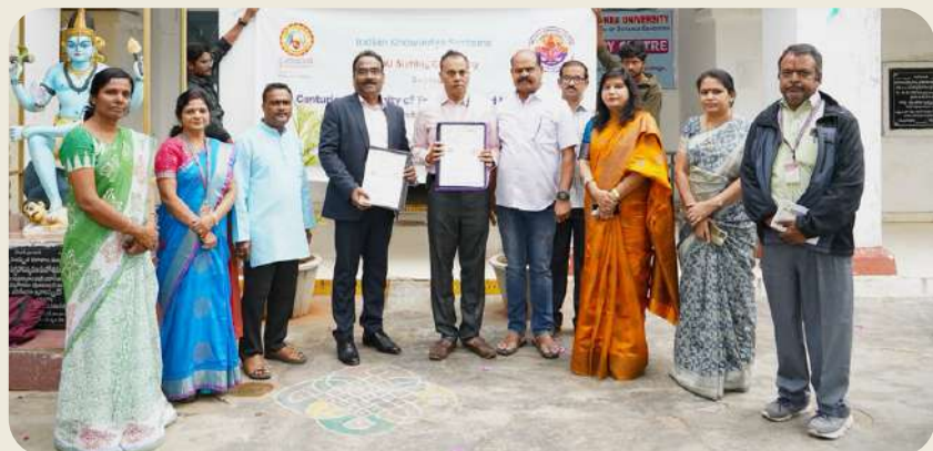
MOU with MR College